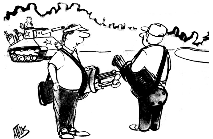
"I think we should let him play through."

During the summer many of you will be traveling and thus gone over the weekend. Please remember that our regular parish expenses do not significantly decrease during the summer. While away – consider sending your contribution to the parish at PO Box 80 OR drop it into the collection – no matter where you attend Mass . There is an understanding among Catholic parishes that these 'out-of-town' envelopes are normally forwarded to the home parish of the giver.