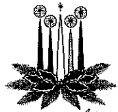
4TH SUNDAY @ Advent