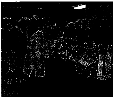
Young at Heart