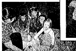
Visit to the Vet