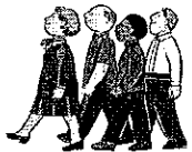
Calling All Seniors!

Do your spirits need a lift? Could you use a night out with the girls? Come and join other women of the parish for friendship and fun on Friday, October 21 st at 7:00 pm in Multi-purpose Room A. There will be wine tasting while we tie fleece blankets for babies being baptized in the parish. All are welcome. A sign-up sheet can be found in the parish lobby. Please consider joining the fun!