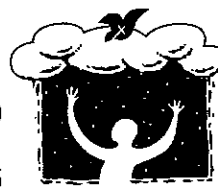
Blessings From Above